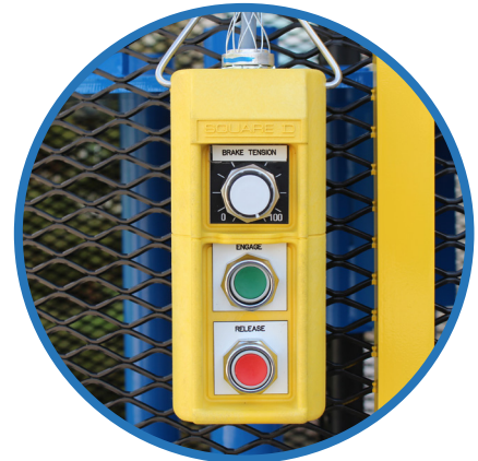
TENSION CONTROL PENDANT