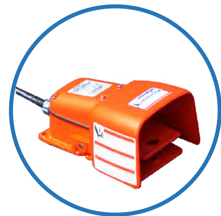
FOOT PEDAL CONTROL FOR POWERED FORWARD/ REVERSE JOG